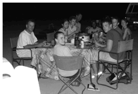
The Emory University group

That night was spent camping on the bank of the Hoanib to make sure we didn't cross paths with elephants wandering downriver at night. I chatted to the group about carnivores, their distribution and various conservation efforts around the country. They were referred to the PCT website where so many field reports and information could be downloaded for reference material.