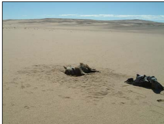
Floggy in the middle of nowhere

We downloaded 340 GPS positions from his collar. He spent some time at the Van Reenen Bay seal colony, but used an area approximately 30 km north-east to rest. He also visited the Kaukasib fountain regularly. On his last day, he walked a distance of 35 km from his resting site to the Kaukasib fountain and then towards the coast. From his movement data, we think that he was actually a nomadic living male, similar to Norbi, who died beginning of last year near the Koichab Pan. We are really sad, that we couldn't follow his life for longer, but nevertheless learned a lot from his last three weeks of life. At least he died of natural causes and was not hit by a vehicle as so many other brown hyenas.