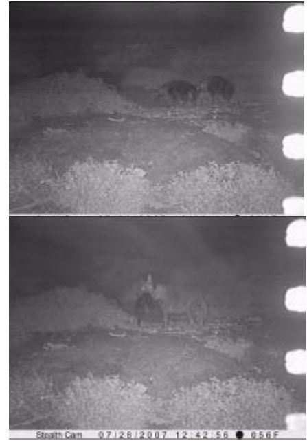
Camera trap images of two cubs and Tosca (wrong date/time stamp)

I couldn't believe my luck. The cub looked to be around five to six months old, but it was difficult to judge from a distance. I observed the cub for quite some time and took care not to disturb it while downloading the camera trap photos – not that the cub really cared much about my presence. It finally started resting in front of the den and I decided to go back to the car to drive back to the office to have a look at the camera trap images. I was sure that I would have fantastic images and also video footage, as one of the camera traps was set to take short, 15 seconds, video clips. And I was right: I got amazing shots of adult brown hyenas and also of the cubs – it looks as if there are actually three cubs around, but I need more images to verify this. The greatest images were of Tosca, carrying seal pups back to the den on a regular basis – what a good mom. I also got images of other adult hyenas and still have to analyse and compare the images with the ID catalogue, as I hope that one of these adults is actually Alaika, the hyena that lost her collar a few months ago.