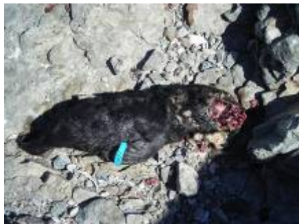
Hyena predation at the seal colony

The last time we collected data about brown hyena predation and seal mortality at a Cape fur seal colony was during the pupping season in 2004/2005. Therefore it was time to do a follow-up study. We were lucky and secured funding from NACOMA to carry out this study during this year's pupping season.