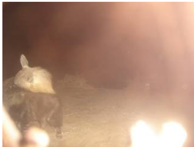
More playing while the jackal is watching...