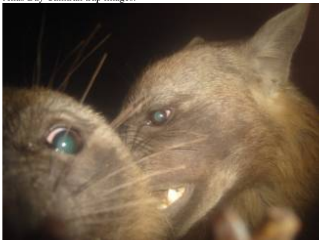
Adult and cub playing