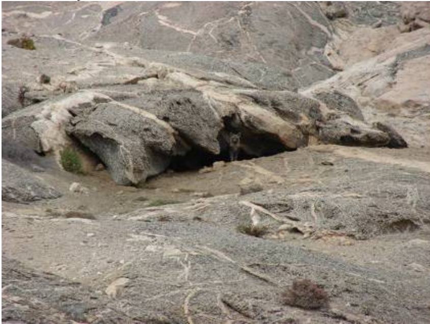
Cub at the den

It's been many years since I was lucky enough to be able to observe hyena cubs at a den site. Most active den sites were quite inaccessible and all habituated breeding females died in the meantime and I had a new task ahead with Tosca. Since Tosca moved from the Luderitz Peninsula into a 'new' area, the study site around the Wolf and Atlas Bay seal colonies, I did not want to risk disturbing her and her cubs at the den site by my presence. Therefore I decided to set two camera traps up close to the active den. Hyena, jackal and also springbok activity was high in this area and I needed to check the camera traps every two weeks to download images and to replace the batteries. To my surprise I was greeted by one of the cubs during one of my camera trap checks at the end of September. The cub was very inquisitive, but stayed close to the den entrance, just in case.